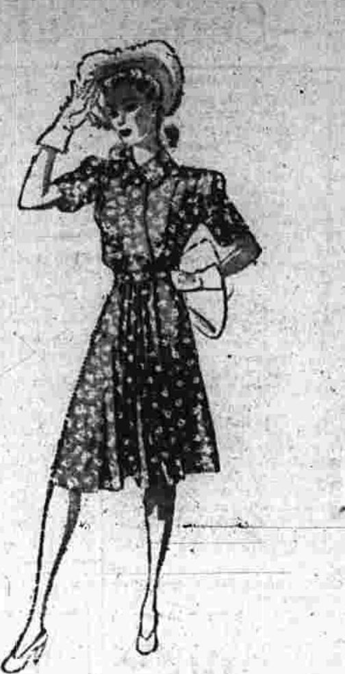
1941 Play Clothes

Headquarters for G. E. Appliances The J.W. HALE CORP. MANCHESTER CONN. Free Parking in Rear of Store